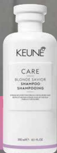
Blonde Savior Shampoo