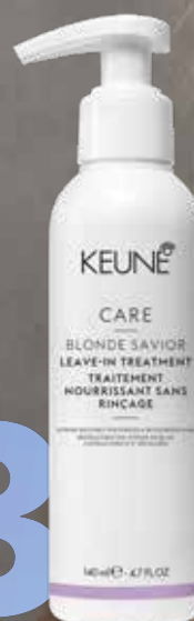
Blonde Savior Leave-in Treatment