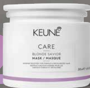
Blonde Savior Mask